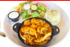
* CAMARONES A LA DIABLA $20.99