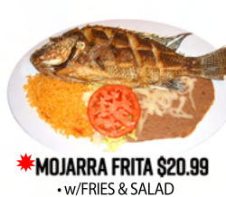
* MOJARRA FRITA $20.99 • w/FRIES & SALAD • w/RICE & BEANS