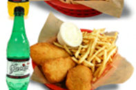
#9 SHRIMP BASKET COMBO $15.63 Single $9.61