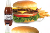
#2 DOUBLE CHEESEBURGER COMBO $15.39 Single $9.50