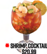
* SHRIMP COCKTAIL $20.99