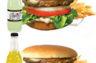
#3 BURGER COMBO $10.87 Single $4.99