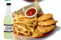
#10 FISH BASKET COMBO $16.68 Single $11.18