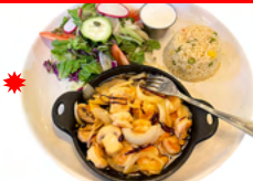
* CAMARONES AL AJILLO $20.99