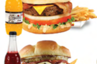
#12 BACON CHEESEBURGER COMBO $14.27 Single $8.39