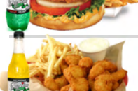
#15 SPICY CRISPY CHICKEN SANDWICH COMBO $14.06 Single $8.18