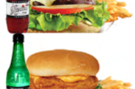
#14 HAWAIIAN CHEESE BURGER COMBO $15.07 Single $9.19