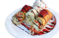
CHEESECAKE BURRITO 7.40