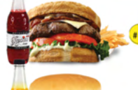
#8 SOURDOUGH BURGER BACON COMBO $14.27 Single $8.39