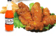
#11 CHICKEN BASKET COMBO $15.63 Single $10.87