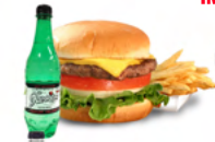
#1 BB COMBO CHEESEBURGER $11.57 Single $5.68

IMPORTANT: ITEMS BELOW ONLY AVAILABLE IN TACOMA, BURIEEN AND YAKIMA